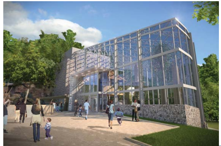
Design and graphics by Zoo Design Inc