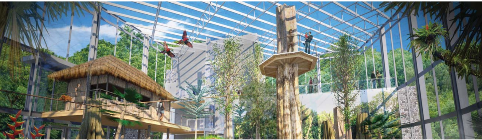
Interior of the tropical house