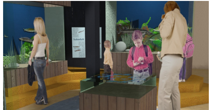
Touch tank displaying young sturgeon a snapshot from animation created by ZDI