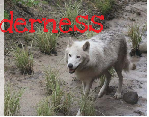
Grey Wolf in her habitat