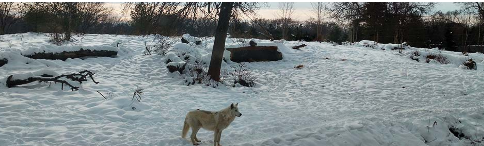
Winter view of the habitat