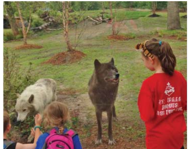
Summer view of the habitat from the cabin interior